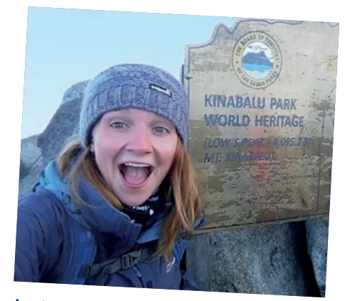
We are so lucky...

We are very grateful to all of you as this has meant that APS Support UK has been able to continue helping people who are affected by antiphospholipid syndrome.