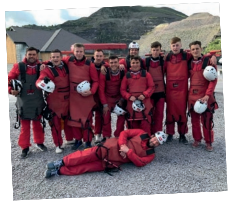
Baildon Rugby Club are go!